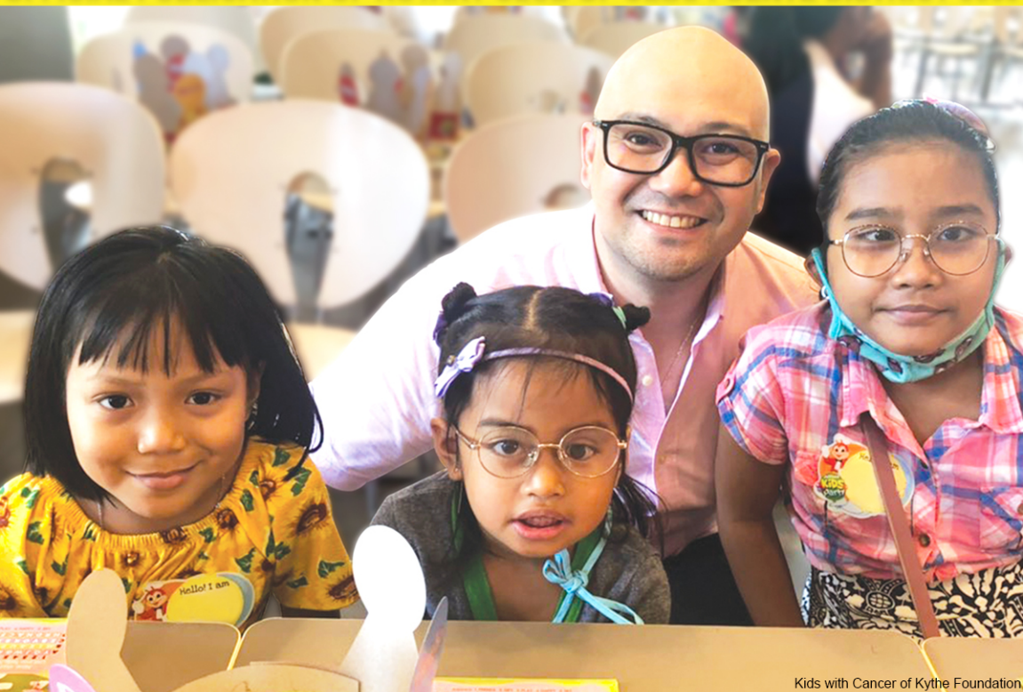
Kids with Cancer of Kytthe Foundation

OFFICIAL PUBLICATION OF ROTARY CLUB OF CEBU FUENTE DISTRICT 3860